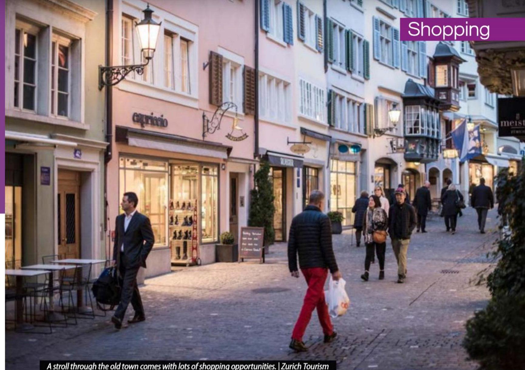
A stroll through the old town comes with lots of shopping opportunities.

Zurich has a reputation as a shopping city , even if it's not quite London or Milan. Bahnhofstrasse is especially renowned as one of the most exclusive and expensive shopping streets in the world. For Swiss and urban design, Europaallee and the area around Langstrasse are good places to start. As far as shopping malls are concerned, Switzerland can't match other European nations where huge centres are the order of the day, but perhaps that's a good thing. The Sihlcity shopping centre, an easily accessible mall that opened in 2007, is an example of innovative development, without the massive sprawl of other malls. The Glatt shopping mall just outside city limits is Switzerland's most popular shopping centre. The malls and best shopping areas of the city are listed here together with other notable shops. Remember that all shops are closed on Sundays except those at the railway stations and some souvenir shops. For more suggestions visit www.zurich.inyourpocket.com